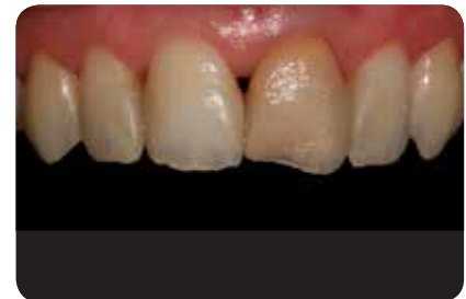
Fig. 3: Pre-op intraoral view