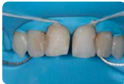
Fig. 8: Preparation of upper central incisors for composite resins