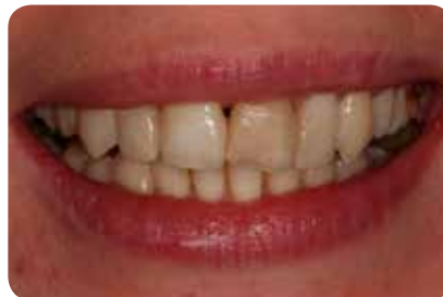
Fig. 2: Pre-op smile