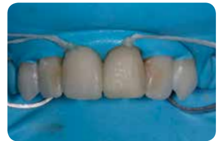
Fig. 9: Composite build up