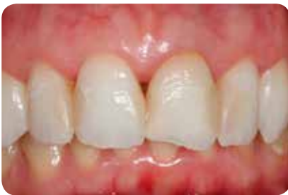
Fig. 7: Upper arch whitening post-op