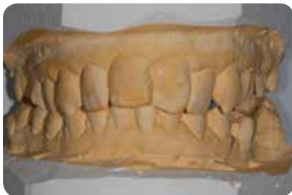
Fig. 1: Patient's preop occlusion

After five days of whitening, the access cavity of the upper left central incisor was sealed and the patient was instructed to wear the tray at night-time only using the whitening gel to whiten the rest of the upper arch (Fig. 6 and 7). Once a satisfactory shade was obtained, there was a pause in treatment for three weeks prior to restoring the central incisors with direct composite resin restorations, to allow the oxygen to dissipate