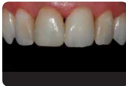
Fig. 11: Post treatment