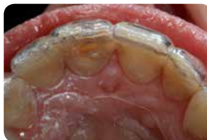
Fig. 5: Essix retainer used for whitening