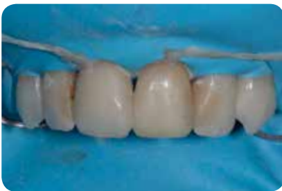
Fig. 10: Polished composites upper centrals