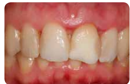
Fig. 6: Inside/ outside whitening post-op