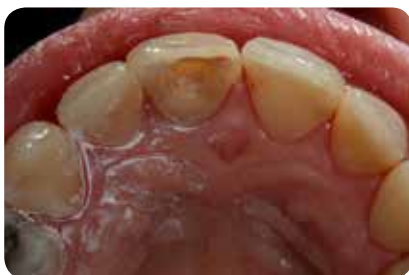
Fig. 4: Prep for inside/ outside whitening