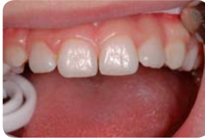
Fig. 8: End situation; the shading properties and the translucence form a very attractive result.

SYNERGY D6 FLOW can be used with all standard composites and is available in all SYNERGY D6 composite Duo Shade colours. I would not like to work without a composite with the properties of SYNERGY D6 FLOW in the dental practice. The ease of using this material in our daily work are due to the excellent flow properties and the high stability of the material. The dentist's work with flowable materials is greatly simplified, because the material can be applied easily and accurately. It can also be used for many other