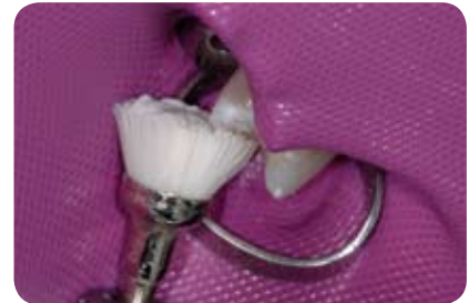
Fig. 3: Cleaning the surface with fluoride-free pumice paste.