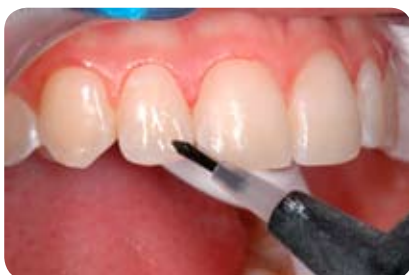
Fig. 4: After spraying the etched surface is wetted with A.R.T. Bond and light-cured.