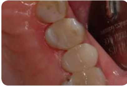
Fig. 14: End situation