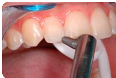
Fig. 2: Cleaning the tooth surface (with Prophylflex (KaVo)) – a thoroughly clean tooth surface is essential for the following steps.