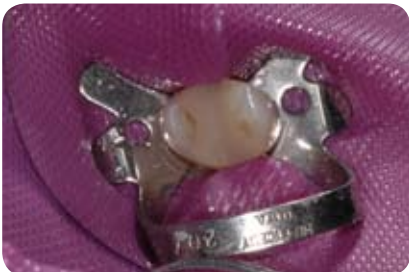
Fig. 4: Cleaned surface