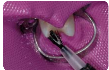
Fig. 6: Application of mixed primer from A.R.T. Bond System to the dentine.