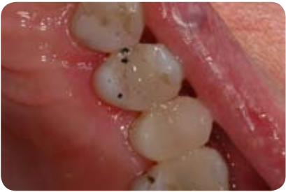
Fig. 13: Checking the occlusion.