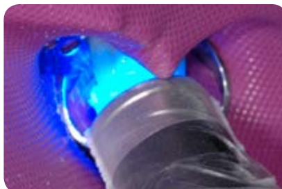
Fig. 8: Light polymerisation for 10 seconds