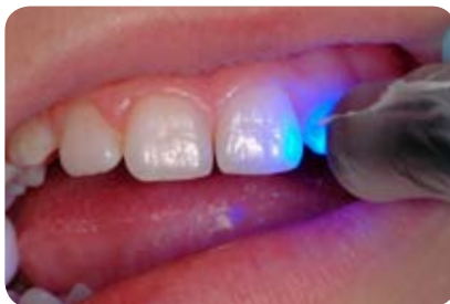
Fig. 5: Light polymerisation of bond for 10 seconds.