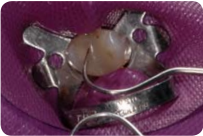
Fig. 10: Distribution with the probe for improved wetting; this is very easy with the flowable SYNERGY D6 FLOW.