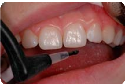
Fig. 4: Application of A.R.T. Bond Systems bond.