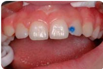
Fig. 2: Enamel etching after cleaning with fluoride-free pumice paste.