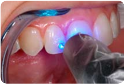
Fig. 6: Light polymerisation