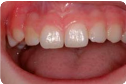
Fig. 1: Initial situation

A young patient did not like a small, rough spot on tooth 22. The enamel defect had been there for a long time, but she only really noticed it after a course of orthodontic treatment. There was virtually no aesthetic effect, but it could be emphasised by colour material deposits. A restoration of the enamel defect would be preventive treatment in the form of fissure sealing.