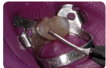
Fig. 9: Application of SYNERGY D6 FLOW: the flowable material can be applied to the site without any difficulty.