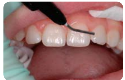
Fig. 6: Application of SYNERGY D6 FLOW.