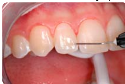
Fig. 5: Application of SYNERGY D6 FLOW with a fine application tip (application tip for etching

gel). The flow is spread with a probe, where the regular wetting does not pose a problem. The dental jewellery can be pressed into the viscous SYNERGY D6 FLOW and applied in exactly the right position.