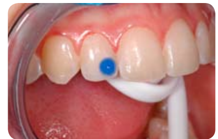
Fig. 3: Etching the surface with 35% phosphoric acid.