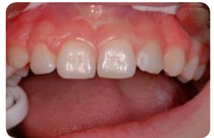
Fig. 3: Visible etching pattern