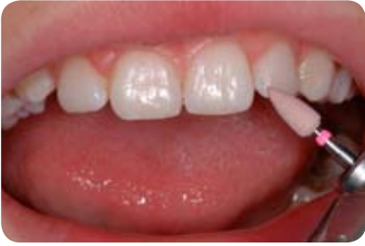
Fig. 7: Efficient and easy polishing.