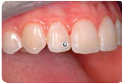
Fig. 7: Final result after polishing with rubber polishing tip. The treatment was concluded with an application of fluoride.