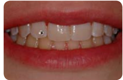
Fig. 8: Final result