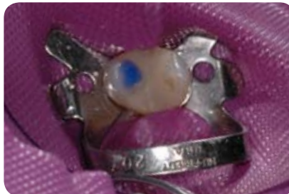
Fig. 5: Etching the surface with 35% phosphoric acid.