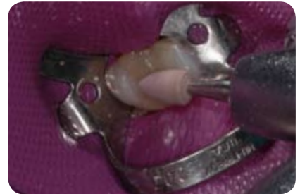
Fig. 12: Polishing with two different rough rubber polishers; the material makes polishing easy with a high-quality result.