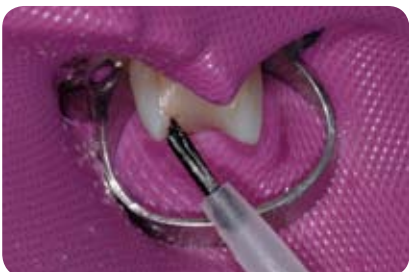
Fig. 7: Application of A.R.T. Bond on enamel and dentine.