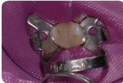
Fig. 2: Placing the rubber dam (Flexidam from roeko).