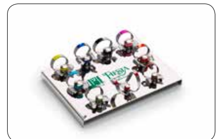
Fig. 6: HYGENIC colour-coded dental dam clamps for fixation of the dental dam