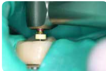
Fig. 8: Root canal preparation of tooth 46