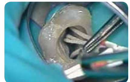
Fig. 12: Final drying of tooth 27 using paper points