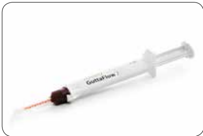
Fig. 13: GuttaFlow 2 for permanent filling of root canals