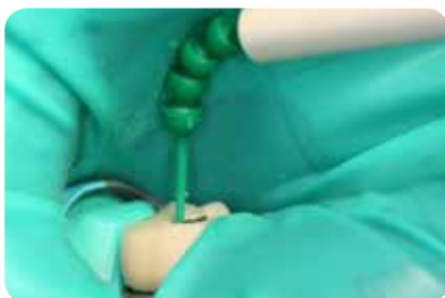
Fig. 4: Curved tip in tooth 46