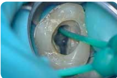
Fig. 10: Aspiration of the residual fluid from the canals of tooth 27 using a Surgitip-endo (up and down motion)