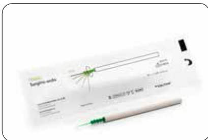
Fig. 1: Surgitip-endo sterile, hygienically, individually packaged

The outer diameter of the canal tip corresponds to ISO 60, the inner diameter is 0.35 mm and therefore, optimally adapted to the prepared ISO sizes of root