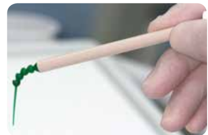
Fig. 3: Holding the Surgitip-endo