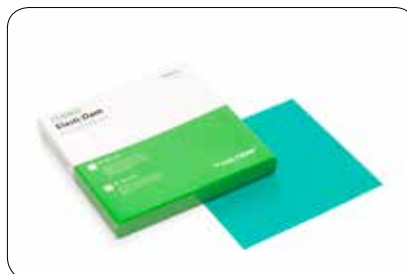
Fig. 5: Elast-Dam, extra-elastic, powder-free latex dental dam