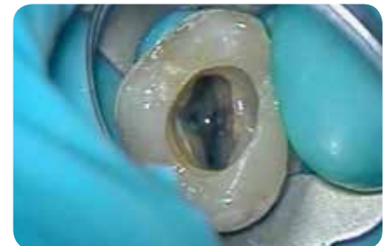
Fig. 9: Detectable residual fluid (reflexion) in the canals of tooth 27 after rinsing