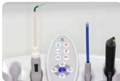
Fig. 2: Surgitip-endo with adapter for standard water aspirator hose