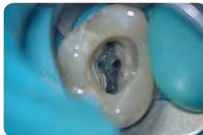
Fig. 11: No detectable fluid on the pulpal floor and in the coronal region of the canals of tooth 27