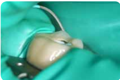
Fig. 7: Dental dam isolation with Elasti-Dam of tooth 46 requiring treatment

After completed drying, both teeth were filled with customised gutta-percha points (ISO size, conicity and length) and GuttaFlow 2 (ROEKO, Fig. 13) and closed using a bacteria-proof composite filling.