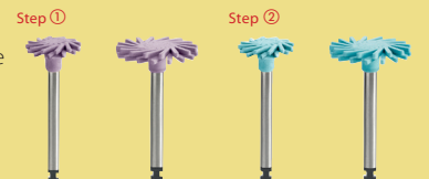
Alpen ShapeGuard® Composite Plus

60021910 Alpen ShapeGuard® Composite Plus Assorted Pack