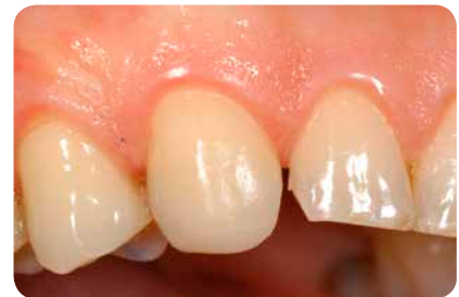
Fig. 6: Situation after build-up of the cuspid with a single layer of BRILLIANT EverGlow A3/D3.