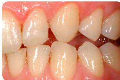
Fig. 17: The final check of cuspid guidance only shows anterior contacts at laterotrusion on imposition of the lower incisor.