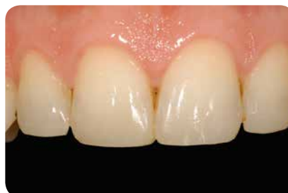
Fig. 20: The middle incisors one week post-operatively, the build-ups appear natural.