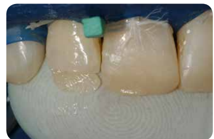
Fig. 12: To avoid palatal excess, the finger can be used as "matrix".