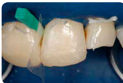
Fig. 11: As only one shade is used, there is no need for elaborate layering.