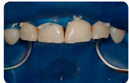
Fig. 9: For build-ups in the anterior tooth region, isolation should always embrace the entire anterior front.