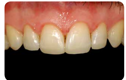
Fig. 18: Immediate postoperative final situation. The restorations appear too dark and too translucent when compared with the dried hard tooth substance.