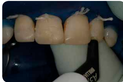
Fig. 14: Universal shade A3/D3 is used exclusively for the restoration.