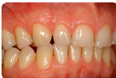
Fig. 2: Laterotrusion to the right: loss of cuspid guidance at laterotrusion in favour of lateral and anterior grouping.