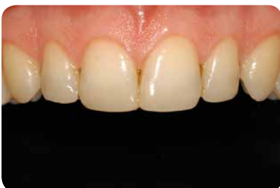
Fig. 19: Excellent optical integration of the restorations was evident postoperatively after one week.