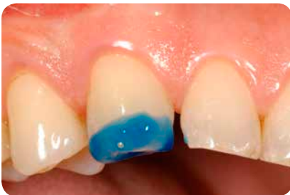
Fig. 4: Selective enamel etching for 30s with 35% phosphoric acid (Etchant Gel S, COLTENE).

is affixed to the first premolars, whereby the dam can simply be placed over the clamps (Fig.10). Following etching and application of adhesive, the anterior teeth were built up stepwise with Duo Shade A3/D3 (Figs. 11-15). Whereas certain overall layer thicknesses need to be taken into account in terms of aesthetic success when layering with opaque, dentine, enamel and translucent materials, the single shade approach allows to cover the entire restoration with one single universal shade. This simplifies the process considerably. To avoid palatal excess, the finger can be used as a "matrix". However,