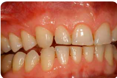
Fig. 7: Restored cuspid guidance results in the desired disclusion of all other teeth at laterotrusion motion.