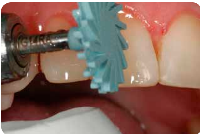
Fig. 16: Polish with DIATECH Shape- Guard polishers.