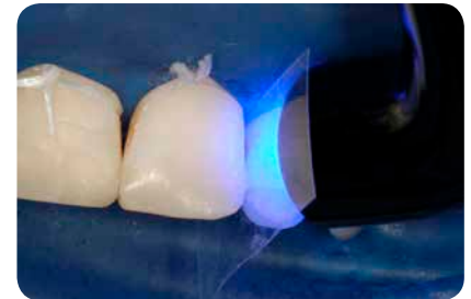
Fig. 15: The respective layers were cured with an S.P.E.C. 3 LEDs with 11 mm light guides at 1600 mW for 15 s. each.