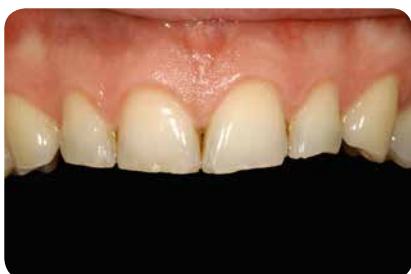
Fig. 1: Initial situation: abraded maxillary anterior with small enamel chipping at the incisal edges of the incisors.

Firstly, cuspid guidance was restored on both sides. Only minimal bevelling was generally carried out to prepare and the transition from the vestibular surfaces to incisal was designed convex using Sof-