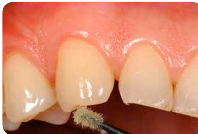
Fig. 5: Establishing a hybrid layer is to be supported actively by massaging for 20s with ONE COAT 7 UNIVERSAL.