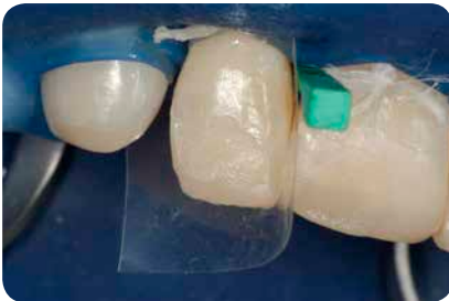
Fig. 13: A translucent matrix is placed for layering the approximal wall.

One week later the patient presented again for a follow-up and for assessment of the aesthetic integration of the restorations (Figs. 19 and 20). The restorations