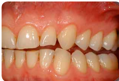
Fig. 8: Situation after restoring cuspid guidance on the left side.