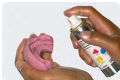
Fig. 3: Isolation of the silicone matrix key using GI-MASK Universal Separator.