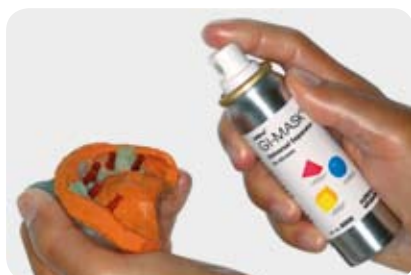
Fig. 1: Isolation of the impression using GI-MASK Universal Separator.

Direct fabrication of a gingival mask for implant-supported superstructures: after taking an impression, the gingival mask is fabricated directly in the impression. A separating agent should be used before applying the high-grade A-silicone, e.g. Gi-Mask from Coltène. Silicone indices should be fabricated to act as a boundary for the gingival mask. The gingival mask is applied directly into the impression around the analogue implants and, after a short setting time, the removable gingival section is trimmed to a conical shape for fabricating the model. Indirect fabrication of a gingival mask for crown and bridge restorations: once the master model has been fabricated, the gingival stone segment is converted into a removable silicone gingival mask. A silicone index is produced with the screw-retained gingival abutments. The stone gingival segment is now trimmed away to the upper section of the implant analogue. The A-silicone is injected into predrilled filling channels in the silicone overcast. The gingival mask is then prepared by the dental technician.