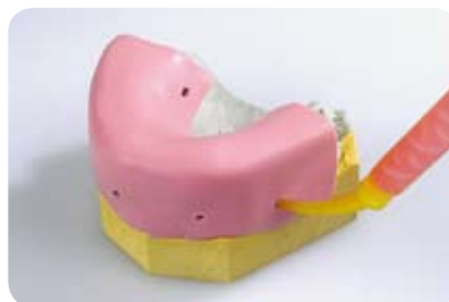
Fig. 4: Injection of GI-MASK Automix New Formula material.