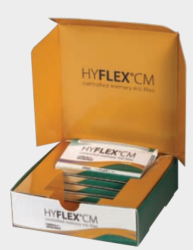
HyFlex® CM™ Intro Kit