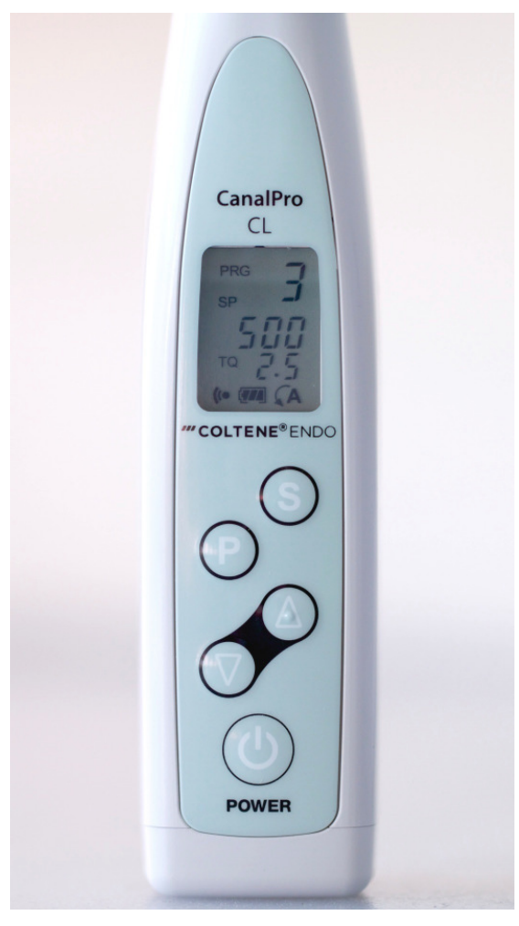
Picture 6: Display and control panel of the new CanalPro CL handpiece