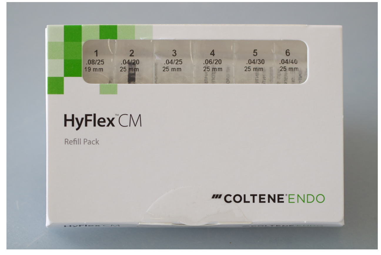
Picture 1: HyFlex<sup>™</sup> CM standard set of files in the original packaging