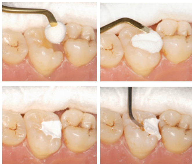
One component without mixing. Good retention in the cavity. Easy removal.

© 2015 Coltène/Whaledent AG – www.coltene.com